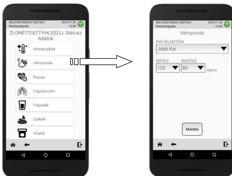
Possible state data